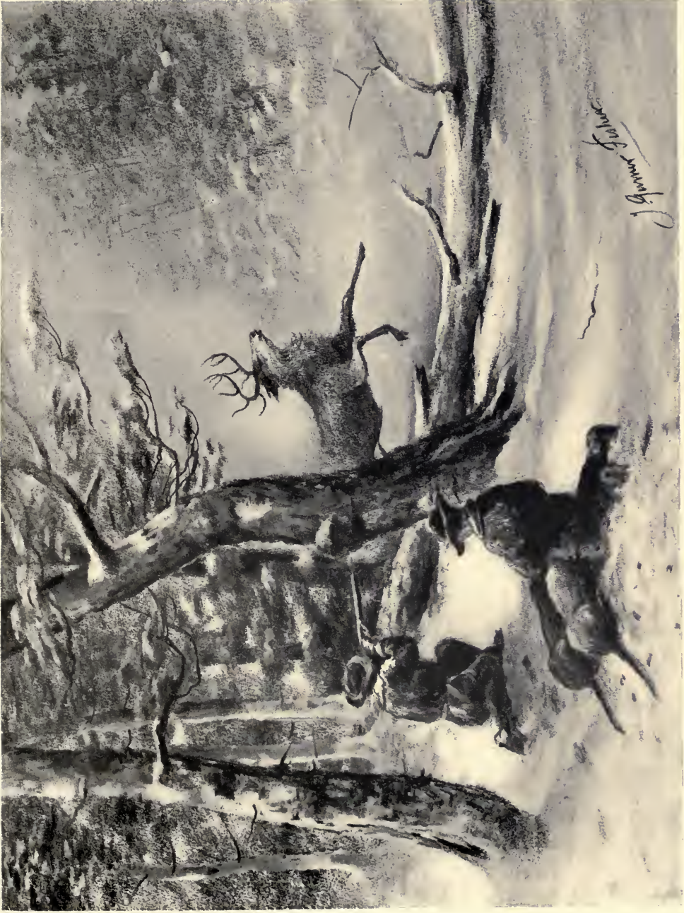
THE OLD TRAPPER'S SHOT.